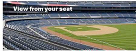
Game Cancellation —Yankee Rain Date